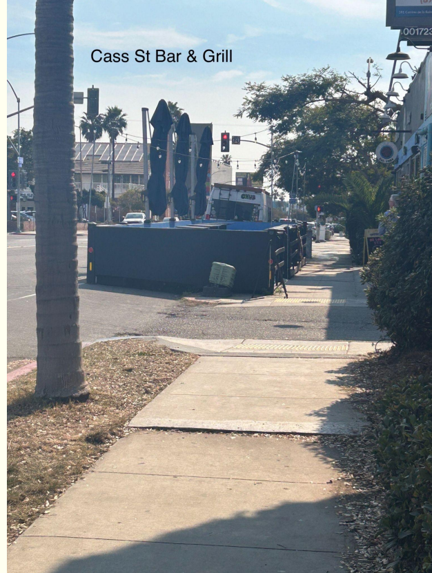
Cass St Bar & Grill