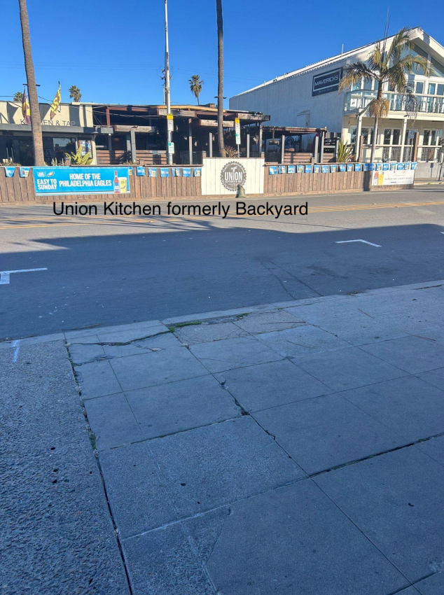
Union Kitchen formerly Backyard