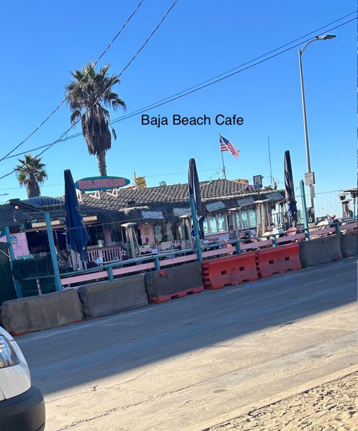
Baja Beach Cafe