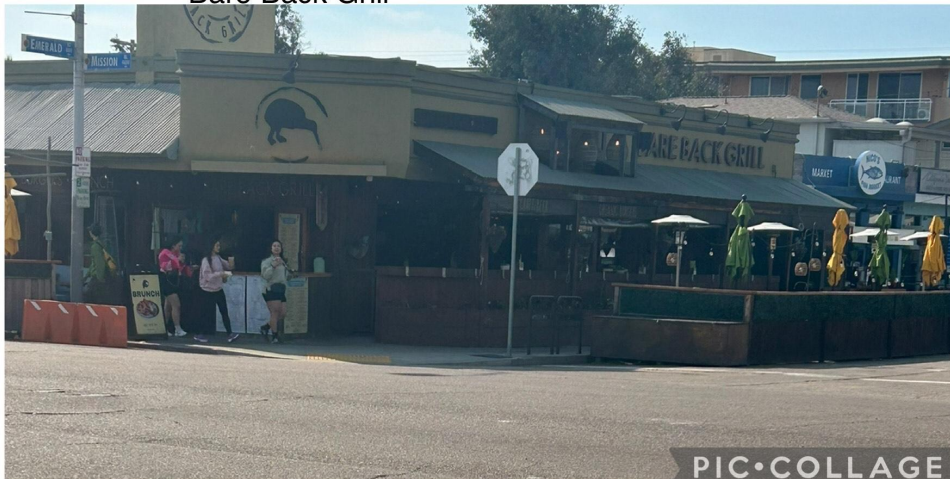
Bare Back Grill