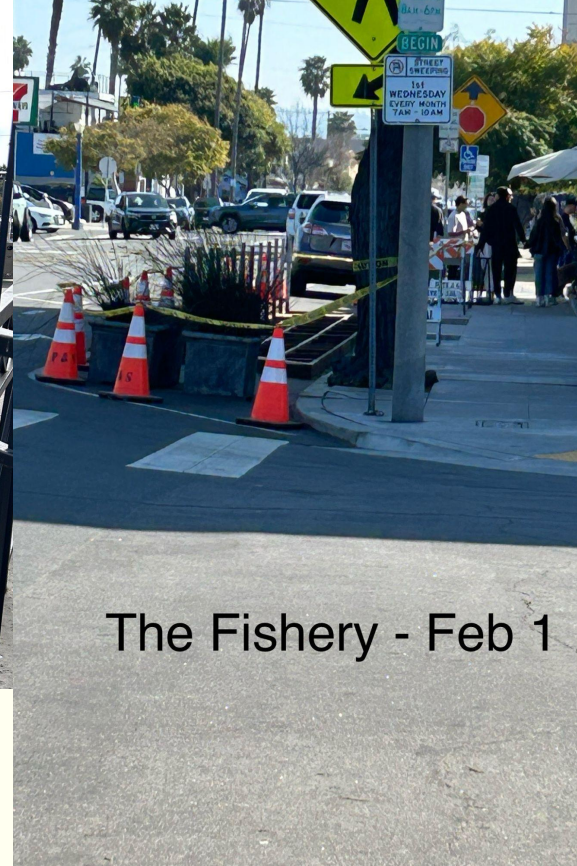
The Fishery - Feb 1